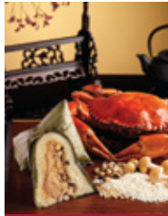
White Pepper Crab