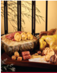
10-Head Abalone with Whole Chicken, Conpoy, Shiitake Mushroom