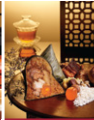
Signature Pork with Salted Egg Yolk