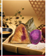
Japanese Purple Potato with Kidney Bean, Palm Sugar