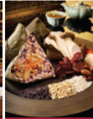
Black Truffle 5-Grain Vegetarian